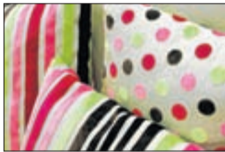
CUSHIONS: Splash of colour

Once you've decided it's time to get that long-awaited redecoration project under way, one of the most tedious tasks you face is trudging around numerous fabric and design shops in search of your new colour and fabric scheme.