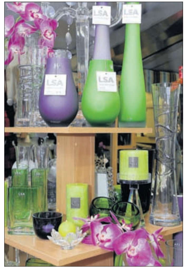
WORTH A VISIT: There is so much to view at the Low Woods showroom you will need to set aside at least a couple of hours