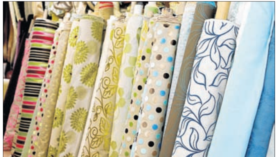
QUALITY FABRICS: There are some 80,000 metres of fabrics continuously in stock

"We certainly all have very different tastes," she smiles. "I'm definitely more from the classical school, but two of our staff love anything contemporary.