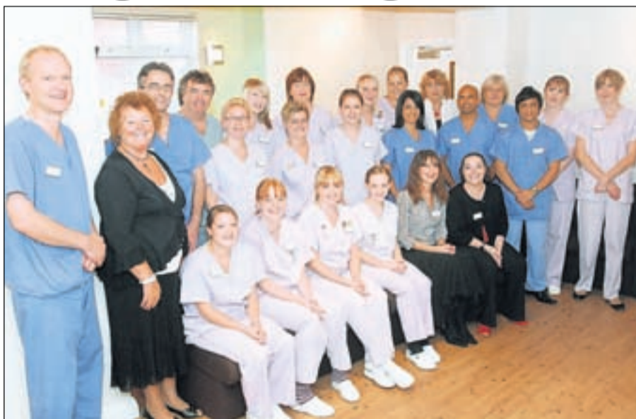
SMILING THROUGH: The team at Lavender Road Dental practice

Instead, think of it as your passport to a radiant smile, either through sensible, professional advice, or the application of the clinic's various hi-tech cosmetic proced-