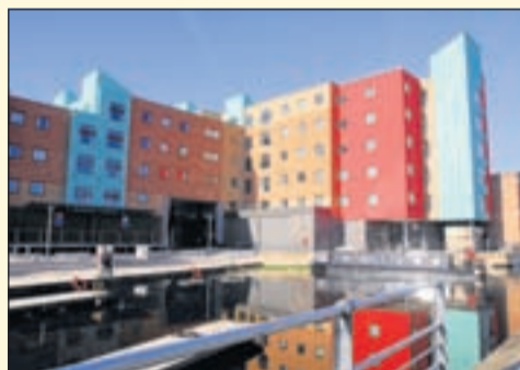
NEW: Loughborough Wharf